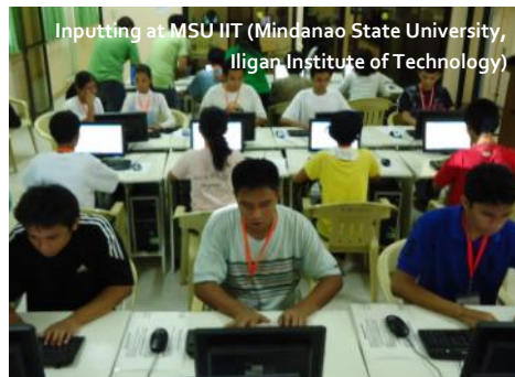
Inputting at MSU IIT (Mindanao State University, Iligan Institute of Technology)