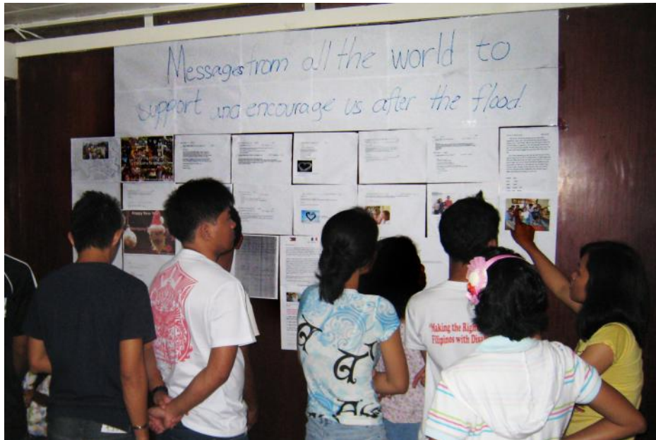
In the Life Project Center the young people from Hear Us! discover the first messages of support. To date they have received nearly 100 messages, from Europe, the US, India, the Philippines ...