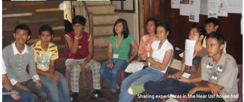
Sharing experiences in the Hear Us! house hall