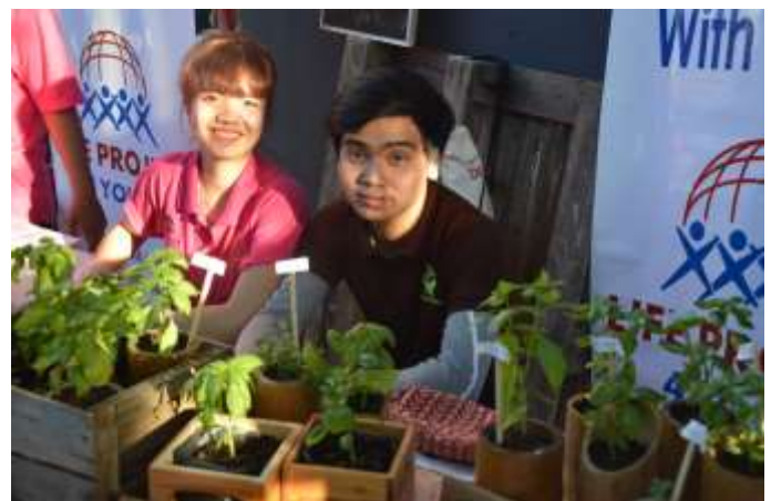
Sales from the Seeds of Hope Program, January 2016

The marked increase in donations over the past two years is the direct result of the hard work of our teams. The donations emanating from sales come from the micro-activities (or programs) created in the centers. The increase in cost of the teams in the field, which is covered by LP4Y Paris, from €158K in 2015 to €198K in 2016, represents the increased effort put into the programs. It is calculated that our 61 volunteers would command salaries totalling €2.3M in the private sector. The organizing costs of charity events in the USA in 2016 are justified by funds raised at the events.