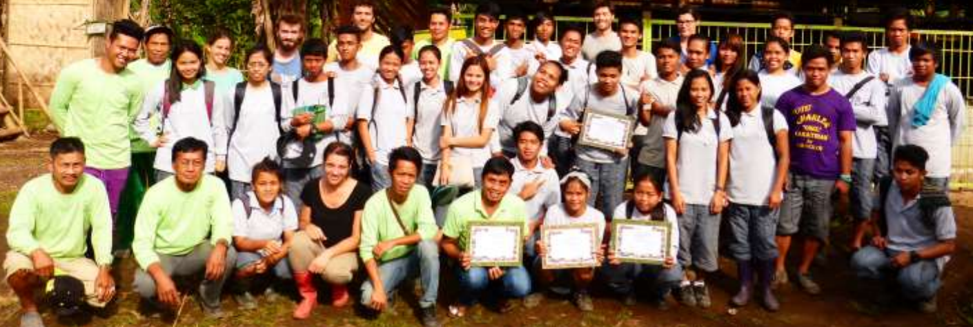
The three Green Village teams in Calauan, Philippines, January 2017